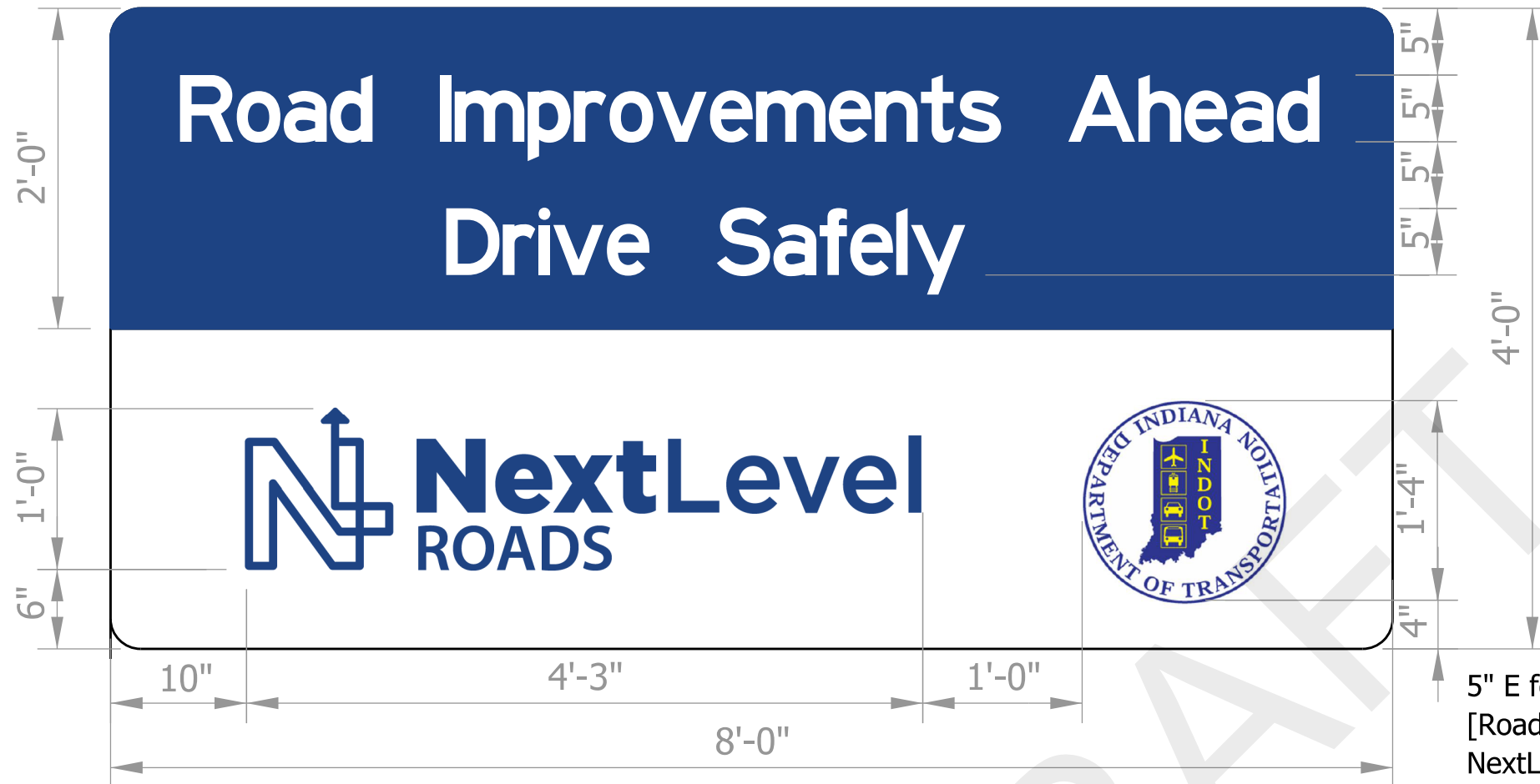
STANDARD SIGN SIZE

5" E font; upper and lower case; 2.25" radius; [Road Improvements Ahead] E; [Drive Safely] E; NextLevel Roads graphic; INDOT Seal