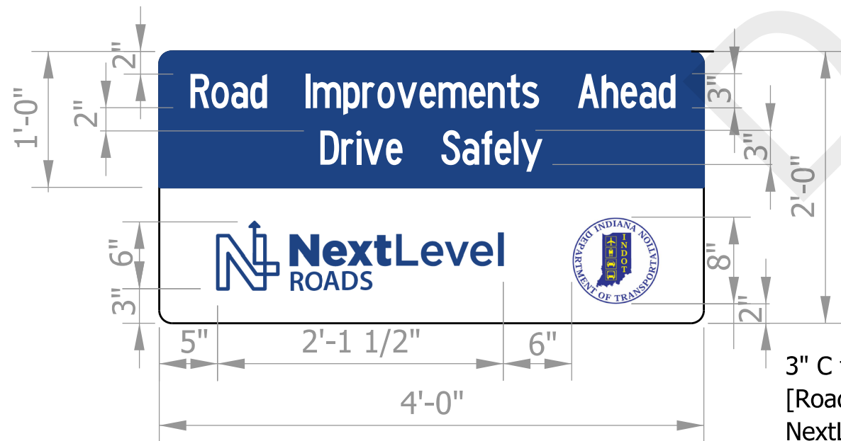
REDUCED SIGN SIZE ④

3" C font; upper and lower case; 1.125" radius; [Road Improvements Ahead] C; [Drive Safely] C; NextLevel Roads graphic; INDOT Seal